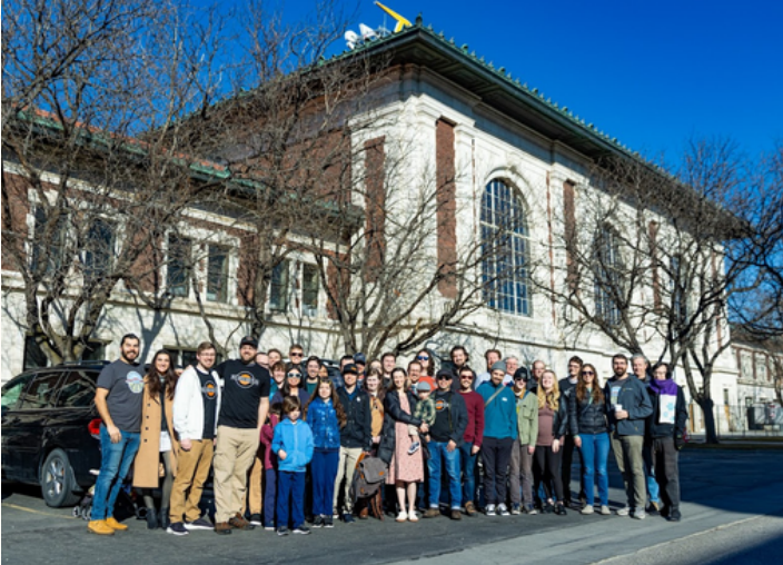
A group of Rio Grande Plan supporters gathered on a cold March morning at the Rio Grande Depot. It was great to meet everyone!